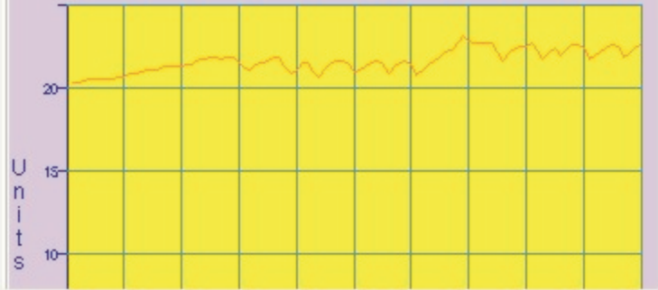
Plot of terminator Room